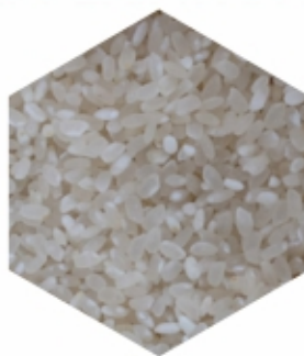
POLISHED ROUND GRAINED RICE