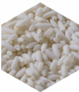
POLISHED GLUTINOUS RICE